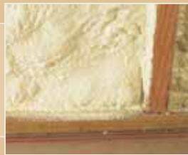
PERMAX CONFORMS TO EVERY ANGLE OF THE WALL CAVITY.