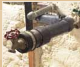
SEALS PIPES AND THROUGH-THE-WALL PLUMBING PENETRATIONS.