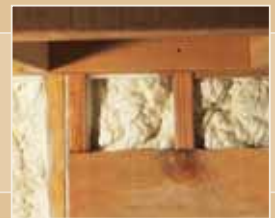
SELF-ADHESIVE SPRAY SEALS SMALL, TIGHT SPACES, UNDERSIDE OF ROOF SHEATHING AND FLOOR BOARDS.

PERMAX Maximum Insulating Power™ By Henry.