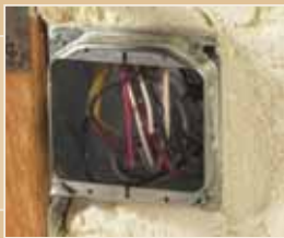
ELIMINATES GAPS AROUND ELECTRICAL OUTLETS AND CONDUIT.

*AIR BARRIER ASSOCIATION OF AMERICA, 2005